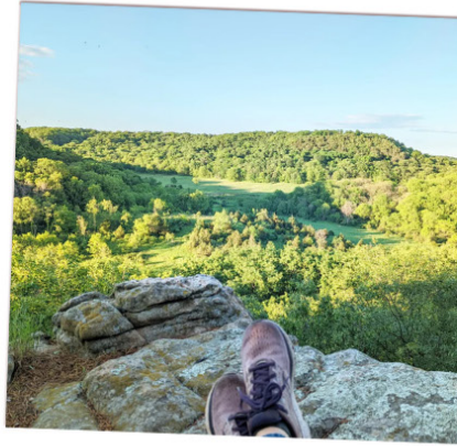
Rock Ledge Cliff