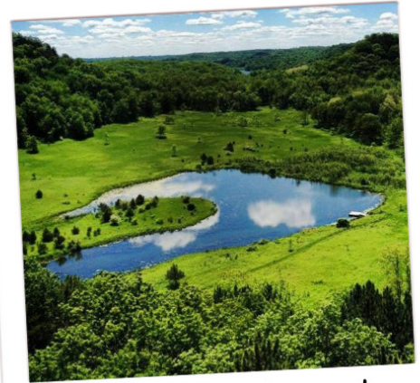
Question Mark Pond