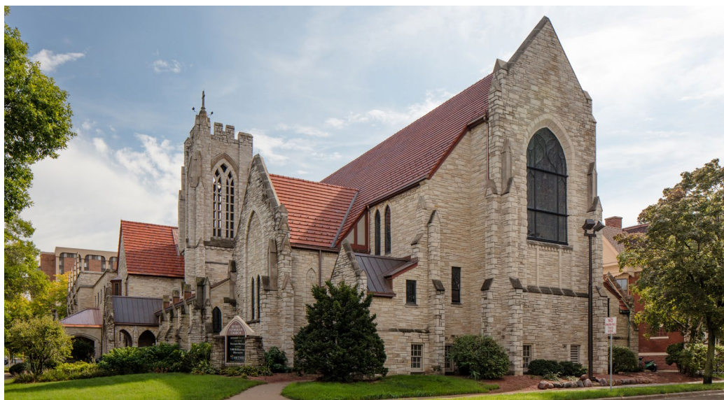
Bethel Lutheran Church