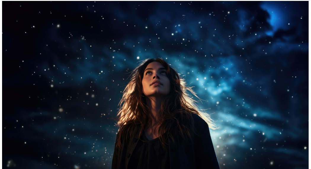
All go to one place. All are from the dust, and to dust all return. - Ecclesiastes 3:20

Return entire form to: Bethel Lutheran Church Attn: Easter Giving 312 Wisconsin Ave, Madison, WI 53703