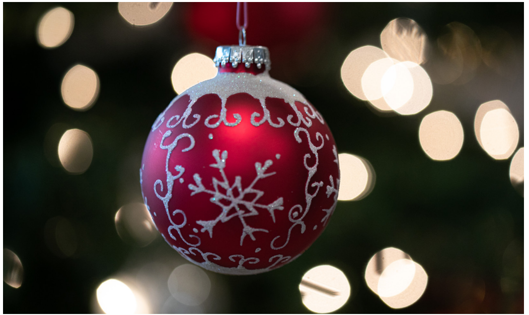
Spread the warmth and cheer - volunteer, give, and be kind to those around you.

We have plenty of options for however you would like to give back: Homeless Ministry, Nursery Volunteers, Food Pantry, Media Ministry. Consider joining our Choir or Handbell Choir to share the gift of music in the new year. Other Ministries can be found on bethel-madison.org . We are blessed to have so many opportunities to better ourselves, our environment, and our community. Consider attending our 9am service on December 17th to enjoy our Children's Christmas Pageant. It