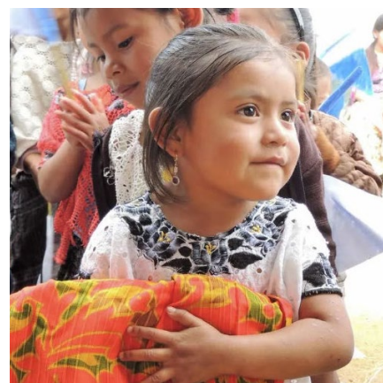
Bethel quilts and kits shelter and comfort children around the world

April 25 marked the eighth anniversary of the deadly earthquake that struck Nepal in 2015. Its toll was huge, killing nearly 9,000 people, injuring 20,000 more and destroying more than 600,000 homes. A second earthquake hit on May 12, causing more damage and casualties. Together, the suffering they caused was incalculable. Bethel's support since then has made possible a relief response that began almost immediately and a recovery process that is ongoing. Lutheran World Relief (LWR) was already working in Nepal with existing development programs close to the epicenter, and there they mobilized an emergency response within the first 24 hours after the first earthquake hit. In the immediate aftermath, LWR staff, in cooperation with local partners distributed food packs, Quilts, Personal Care Kits, water filtration units, tarpaulins and corrugated galvanized iron sheets to affected families most in need. In the months that followed dwellings were built. Today, despite well-documented delays caused by internal political issues, the process of recovery has come a long way, and continues as families work with local government officials and organizations like LWR to build permanent houses designed to with stand future earthquakes. Thanks to Bethel's support through LWR drives, houses are being completed in several poor, rural and isolated villages with quilts and kits providing necessary care. Families displaced by the earthquake once again have a place they can call home.