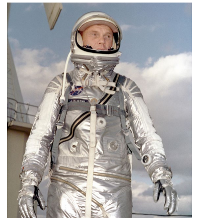
John Glenn Astronaut

As of May 2023, scientists have confirmed and cataloged a total of 5,366 planets outside our solar system. That might seem like a lot. But it really does not even begin to scratch the surface