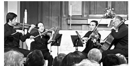
Bethel members and friends enjoyed the Verona Quartet in April.