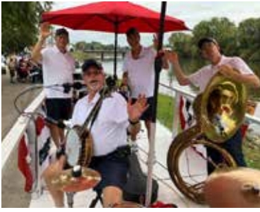
Red Hot Dixie Band