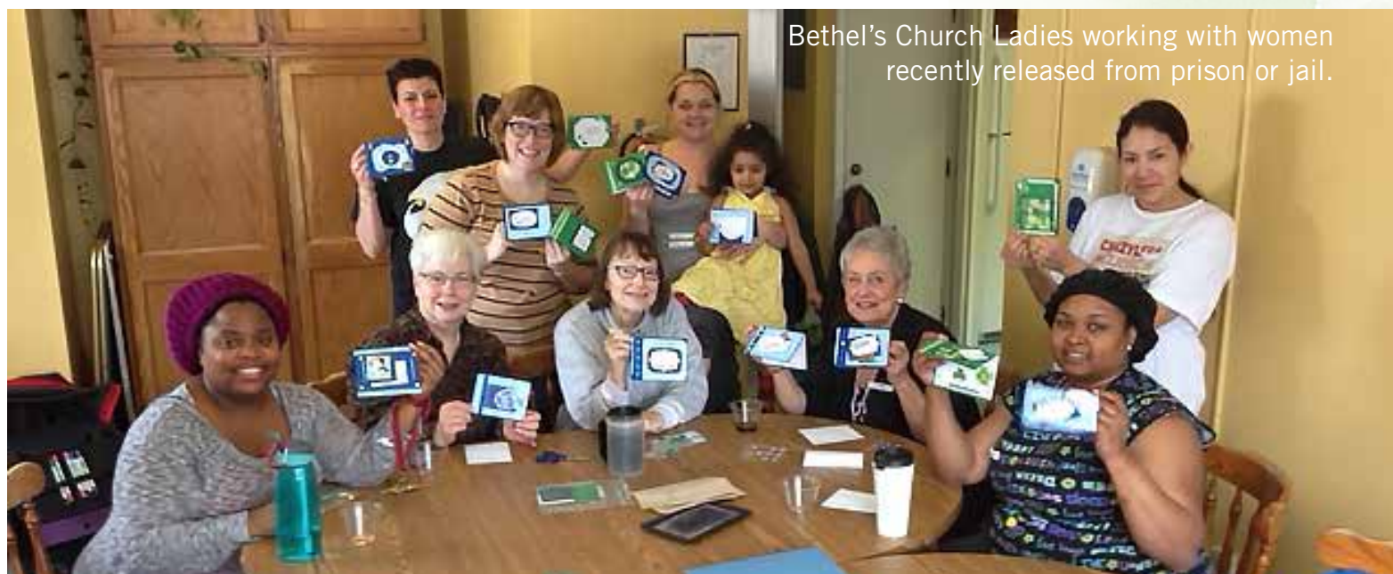
Bethel's Church Ladies working with women recently released from prison or jail.