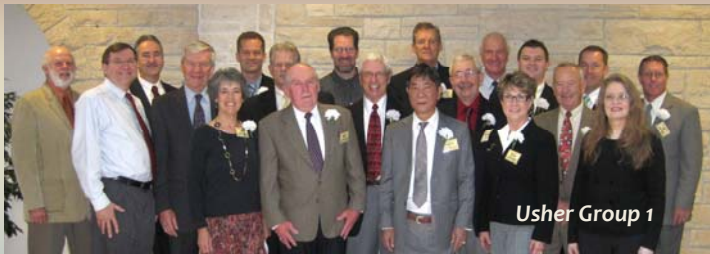
Usher Group 1

Thank you to our dedicated Ushers! Sanctuary, Parking Lot and Sound Technicians