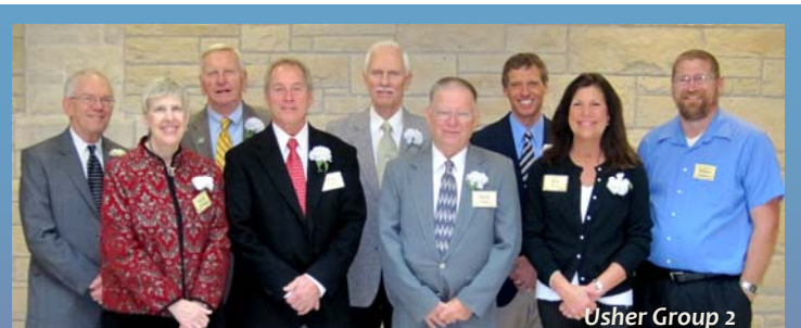
Usher Group 2