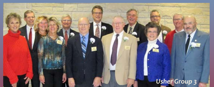
Usher Group 3