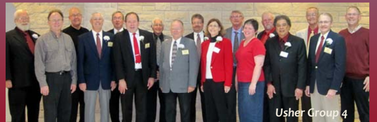
Usher Group 4