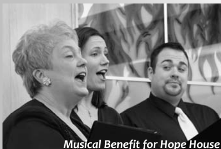
Musical Benefit for Hope House

Time and Skills: Bethel Mission Wheels, Circle of Love, Hope House, Latino Ministries, Madison Schools & Homeless Children, Fair Trade Coffee Sales, Lutheran World Relief kits, Church Ladies Ministry.