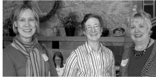
Lydia's House Gathering at Bethel