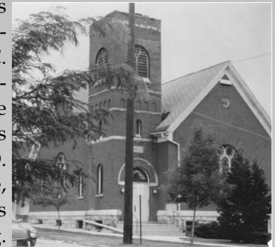
Bethel's second church-Hamilton St.