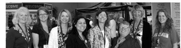
Bethel WCC members at ELCA Triennial Gathering - 2011