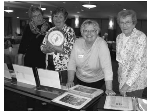
Blanket Workshop Borgwardt Hall

Women's Ministry is about fellowship, sharing, mission and service to others in Christian discipleship. Come join the fun and catch the excitement of faith in action!