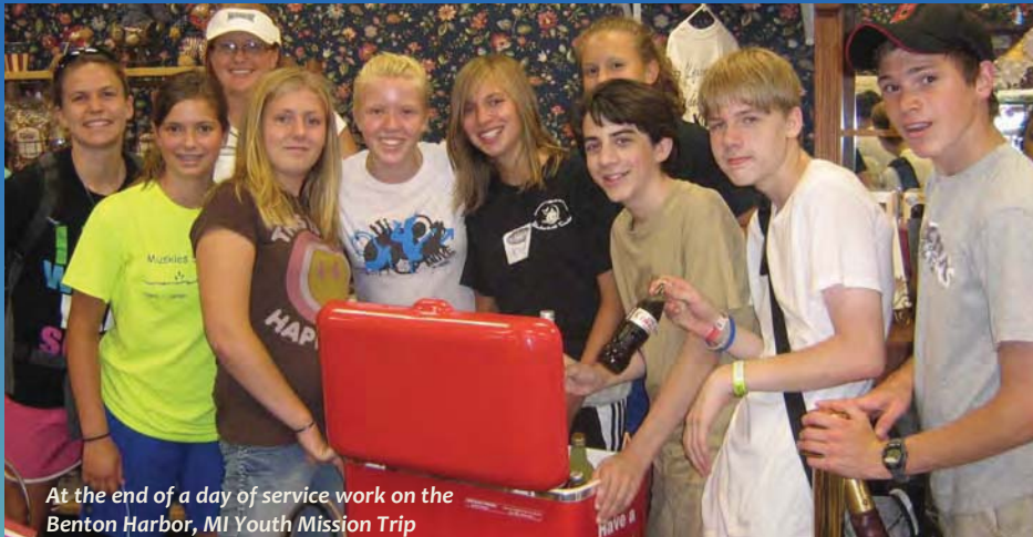
At the end of a day of service work on the Benton Harbor, MI Youth Mission Trip

Get Ready for Sunday School September 12 - see inside for details