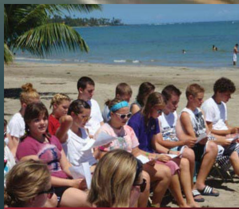
Worship service on the beach