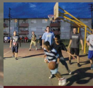
Relationship building with local kids