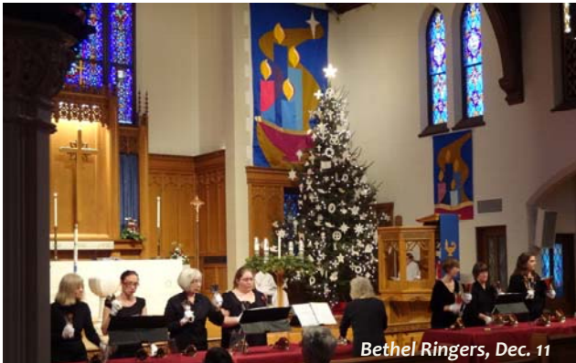
Bethel Ringers, Dec. 11

Thinking in Pictures , by Temple Grandin. All are welcome to join either book club.