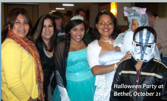
Halloween Party at Bethel, October 21