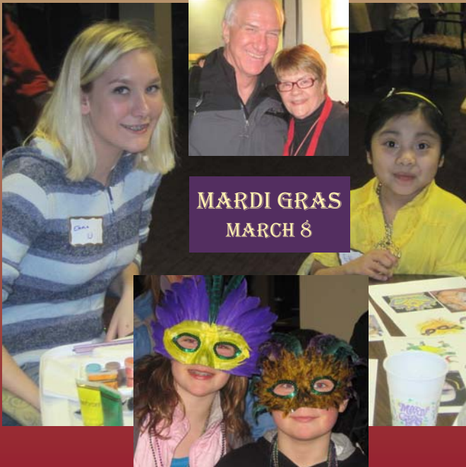
MARDI GRAS MARCH 8