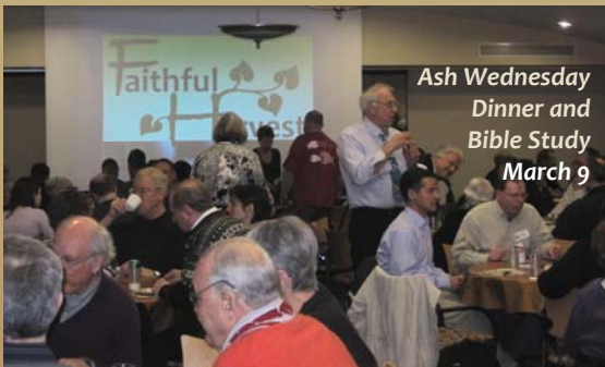
Ash Wednesday Dinner and Bible Study March 9

Over 100 people participated in the first Wednesday night Bible study. You can still register: Jacqui, 257-3577.